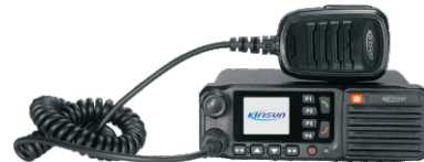
TM840 DMR MOBILE RADIO

For more information, please visit www.kirisun.com or contact marketing.os@szkirisun.com