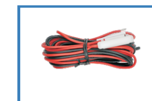
DC Power Cable