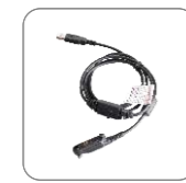
Programming cable PC155