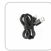
Data cable PC143