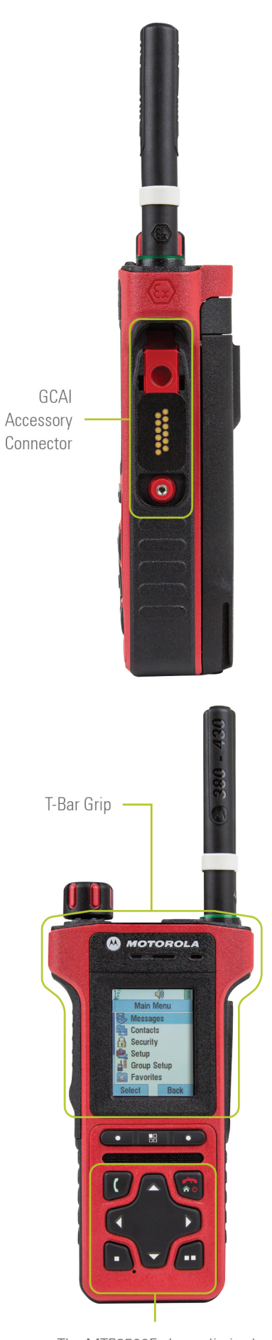
The MTP8500Ex has a limited keypad, ideally suited for use while wearing heavy gloves. For users that need a full keypad we offer the MTP8550Ex.